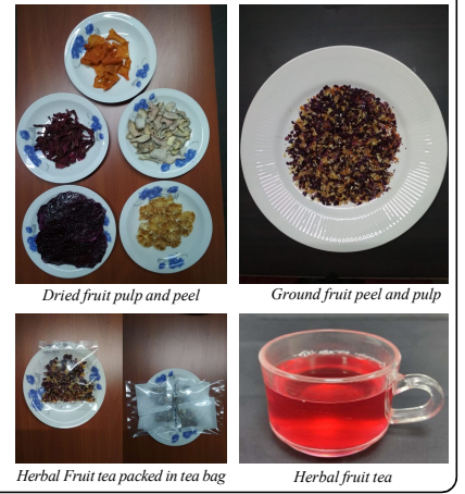
Herbal Fruit tea packed in tea bag

(The author is a Subject Matter Specialist (Home Science), KVK, Chandel, ICAR, Manipur Centre)