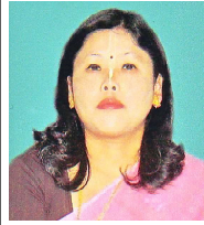
By: Dr. Y. Prabhavati Devi

Herbal fruit tea is fruit based healthy drink prepared from locally available fruits of North East region of India. It is very rich in natural bioactive compounds such as polyphenols, flavonoids, anthocyanins, carotenoids, coumarins, alkaloids, polyacetylenes, saponins, terpenoids etc. It exhibits high natural antioxidants which can scavenge the free radicals which are very reactive and harmful to human health. It is prepared by incorporating dried dragon fruit pulp, peel, orange peel, lemon pulp and ginger by mixing in proper proportion. It is mainly designed to improve the antioxidant status and also to enhance the overall health status. This tea is very rich in natural bioactive compound which helped to prevent the oxidative damage due to over exposure to free radicals in human body. Nowadays, this herbal tea has gained popularity among the health conscious consumer in order to reduce the body weight and also for slimming and maintaining healthy body. This tea is very good for pregnant and breastfed mother as it contains citrus peel, orange peel other fruit and ginger. It is mainly designed in order to boost optimum health as well as for reducing the risk of certain dis-